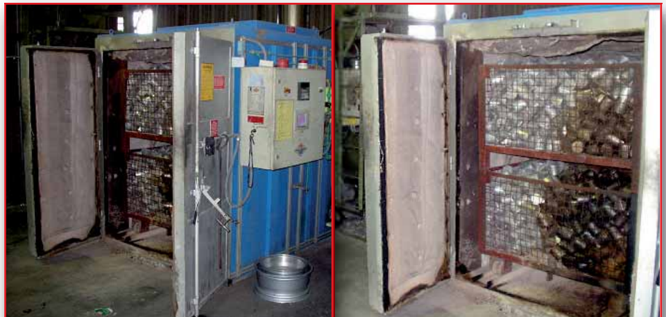
Pallets of briquettes stacked within a Burn-Off Furnace