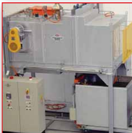
Solution Heat Treatment