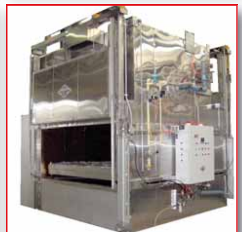
Soldering & Brazing