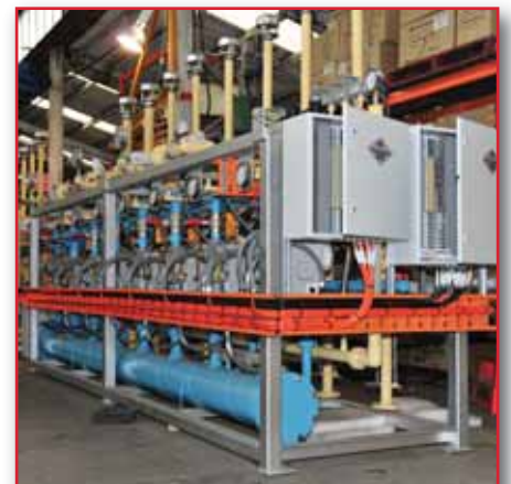
Gas Rig for Multiple Premix Burner System