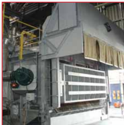
Recuperative Burner System