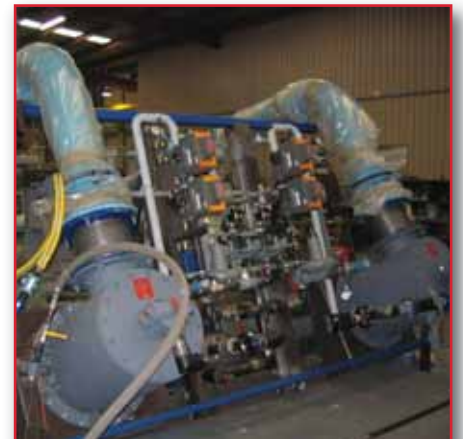
Retrofit Burner System for Melting Furnace