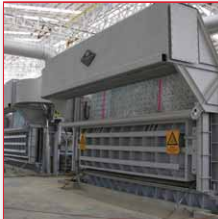
Aluminium Holding Furnaces