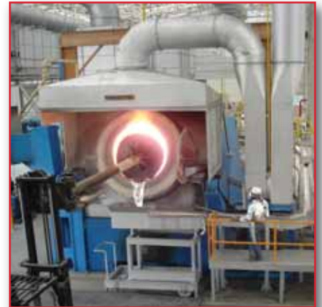
Tilting Rotary Furnace