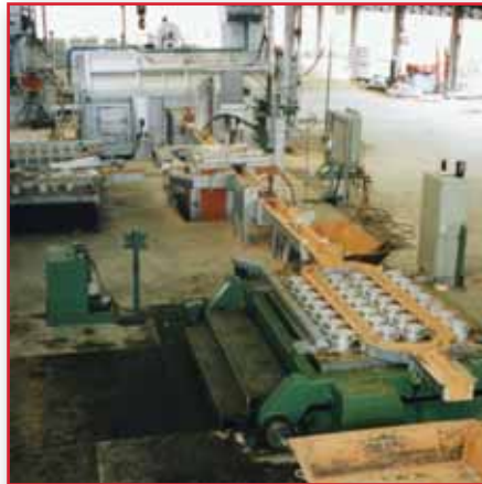
Billet Casting Line